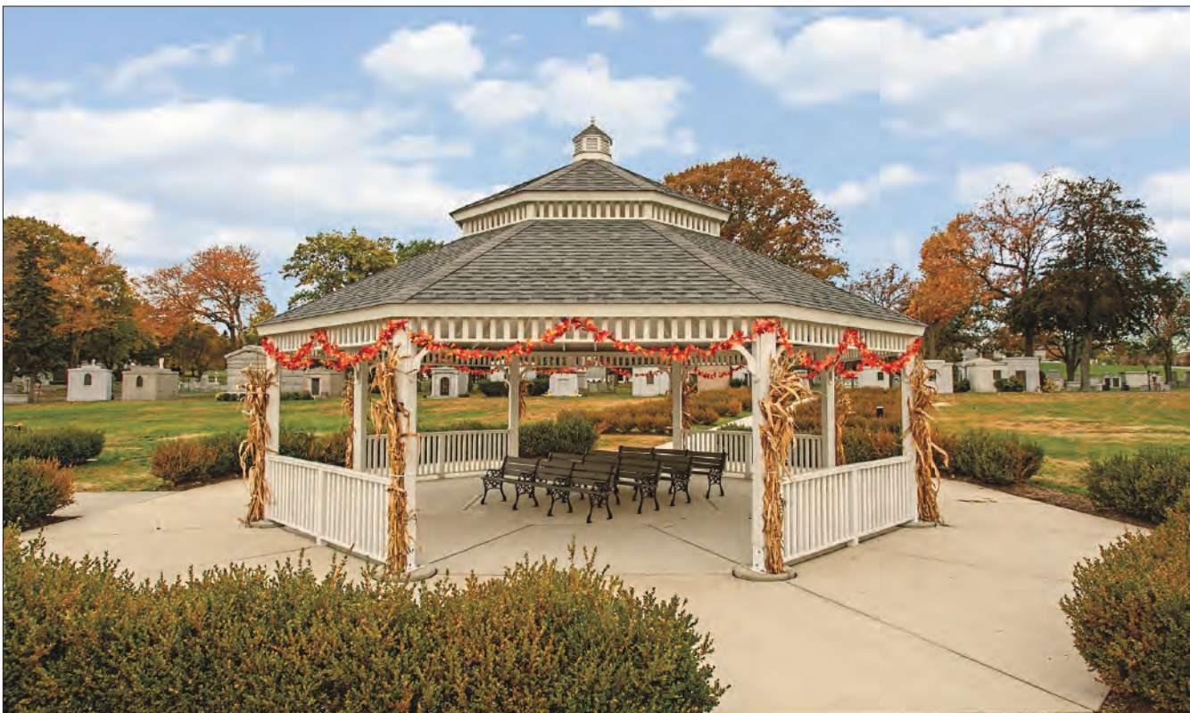
This centrally located Gazebo provides a special location for community events and activities sponsored by the cemetery.

It helps educate students about the Order of Christian Funerals and Catholic burial practices, and teaches that a cemetery can be a positive and uplifting place to visit, reflect, pray, and remember departed loved ones.