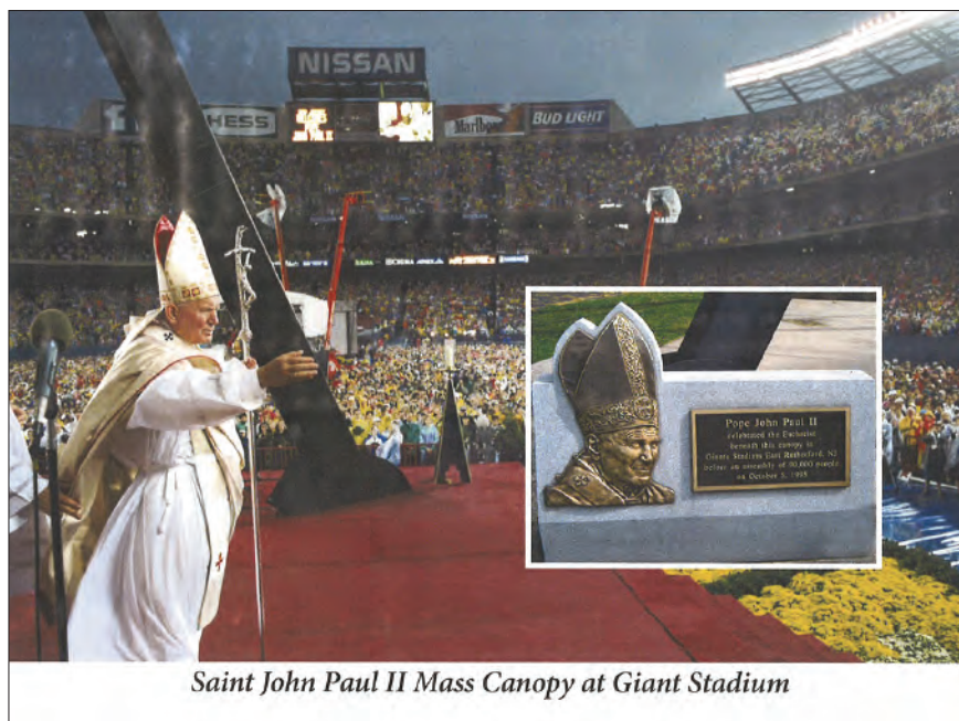
Saint John Paul II Mass Canopy at Giant Stadium

carved base depicting Adam and Eve's fall from grace. The inspiring art reminds visitors of the Catholic faith and tells the stories of the Bible from creation to the resurrection.