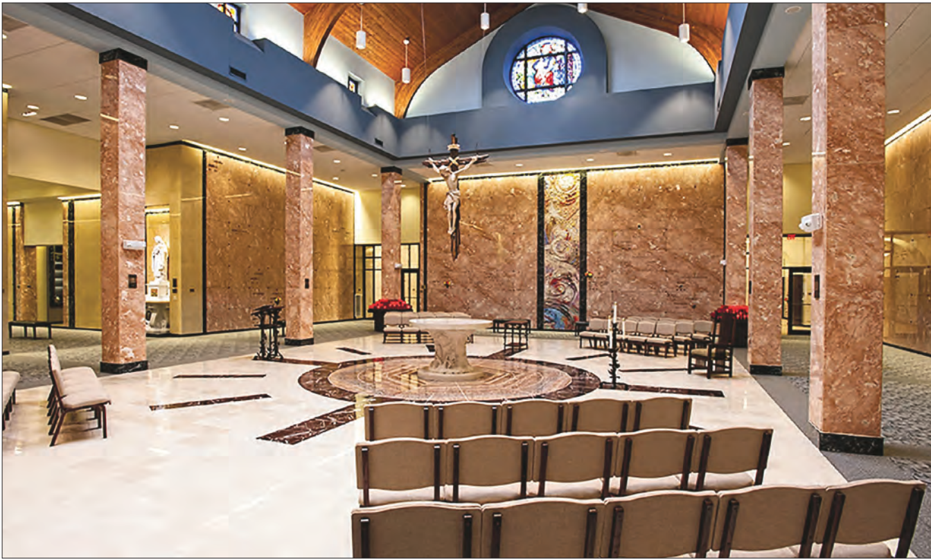
Holy Cross Cemetery and Mausoleum also features 100-year-old stained glass art, including an 85-year-old, 10-foot Rose Window depicting Jesus with children, and various Altars and statues reclaimed from now closed churches in Newark. Below, one of the floor-to-ceiling mosaics, part of the Genesis collection as shown in the Mausoleum Chapel above, depicts Adam and Eve's fall from grace.

way for the community to remember and memorialize their loved ones.